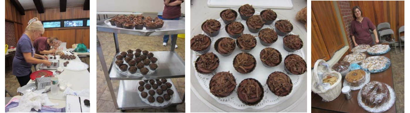
Above: Preparations for the dessert table including chocolate mousse cups, apple walnut cakes and chocolate coated cream puffs

"Stressed" spelled backwards is "Desserts"! (Author Unknown)